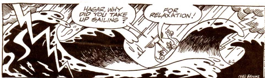
HAGAR THE HORRIBLE BY DIK BROWNE

It's been a good season with good Tasar fleets and lots of battles throughout, and we look forward to the new season starting, with several new Tasars joining the ranks.