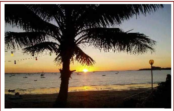
Another beaut sunset from the Darwin Sailing Club

The 2003 NT Tasar Championships were held in July and heaps of fun was had by all who participated. The conditions turned into traditional Darwin stuff with fluky land breezes in the morning which turned to light sea breezes during the afternoon races.