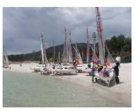
Sailing at McCrae...